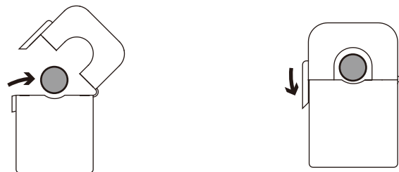
3. In the lead